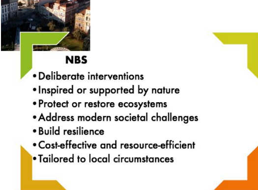
Figure 1. Nature-based solutions attributes.